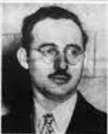
Supreme Court and Eisenhower Reject Couple's Last Pleas

WASHINGTON, July 30 (AP)—The Supreme Court today rejected the last pleas of Julius and Ethel Rosenberg, and the Eisenhower administration today announced that it would not commute the atomic spies' death sentences.